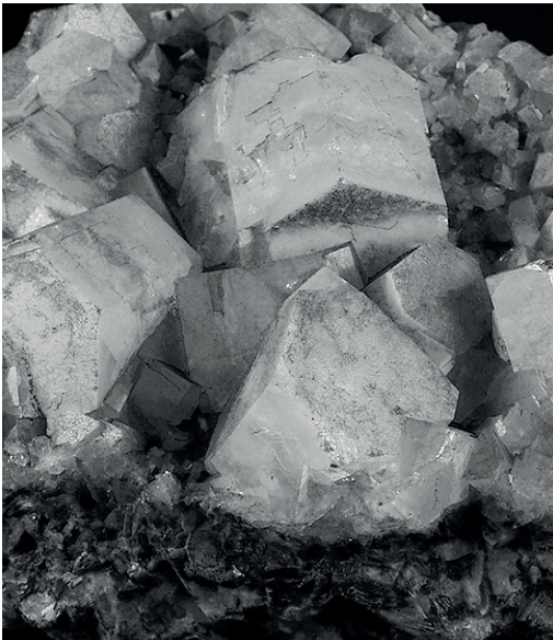
Aragonite, Romania. Coll. University of Bucharest.

We all know that life evolved over time. As research advances, we progressively improve our understanding of the chemical and physical processes that led to the appearance and evolution of life. Minerals underwent something similar. Minerals did not “evolve” in the pure sense of the word, but rather they diversified. As time passed, more and more chemical reactions took place, which led to increased mineral diversification. The process was initiated with about 60 minerals present in chondrites more than 4.55 billion years ago. From there, under the action of heat and fluids, over billions of years of chemical reactions, and strongly affected by the appearance and evolution of life, thousands of minerals formed. There were 5616 documented and approved minerals as of July 2020. And the quest for new minerals continues!