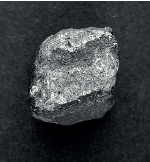
Allende meteorite. Chihuahua, Mexico.

How did the Moon form? A small planet, called Theia, most probably about the size of Mars, hit the proto-Earth. The impact was giant, hence its name. It produced a huge disk of debris from which the Earth and the Moon as we know them condensed. But ours was not the only giant impact. In our solar system examples abound of traces of such impacts. For example, Pluto and his moon Charon must have formed from such a giant impact.